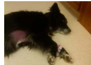
Pika after bite. Note red bruising. In this picture she is actually asking to have her belly rubbed.

What NOT to do if your pet has been bitten: