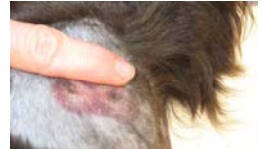
Pika's bite was high up on her neck, under her collar. Note the wound site and size.

Even the best prevention can fail and sometimes the bite occurs without anyone having seen the sn[Type a quote from the document or the summary of an interesting point. You can position the text box anywhere in the document. Use the Text Box Tools tab to change the formatting of the pull quote text box.]